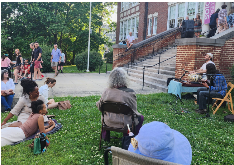
LEFT: Enjoying the music on McGuffey's front lawn

Sincerely, McGuffey Executive Council '22-23