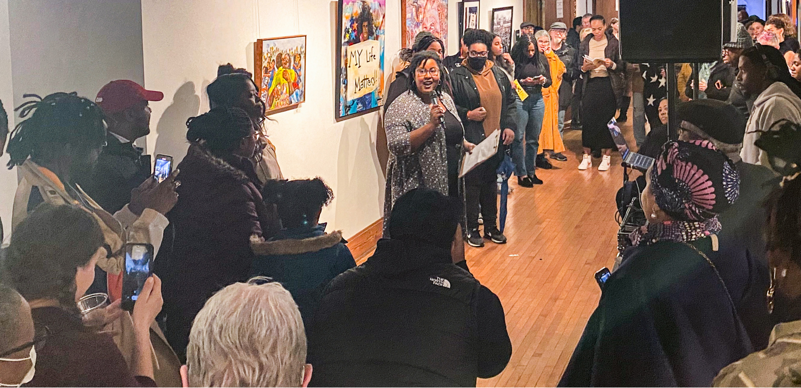
March 2023 First Friday opening reception for Charlottesville Black Artists Collective Exhibition, "Blackity Black Black"